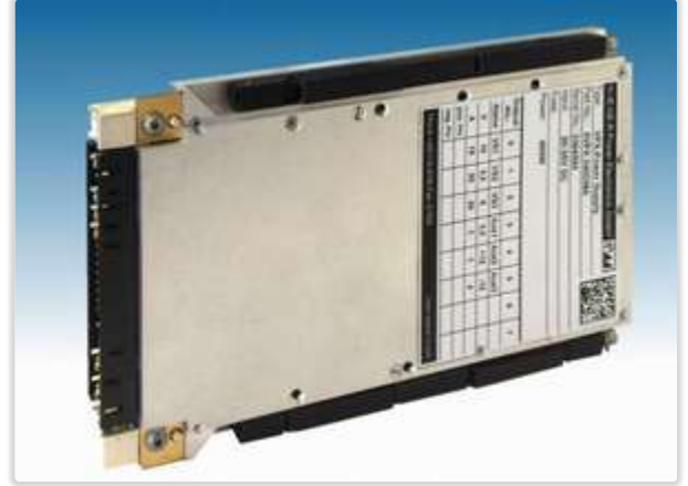
VPX340 - High Efficiency / Medium Power

The VPX power supply mechanical dimensions are 3U x 4HP (0.80" slot). It is outfitted with connectors, keying and alignment mechanism as per VITA 62.