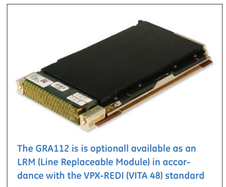
The GRA112 is optionally available as an LRM (Line Replaceable Module) in accordance with the VPX-REDI (VITA 48) standard

The GRA112 is a form, fit and function replacement for the GRA111, and may be deployed in the MAGIC1 Rugged Display Computer to provide a fast-to-market solution for high-performance graphics and GPGPU signal processing applications.