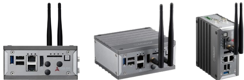
■ MXE-200/200i with Antenna