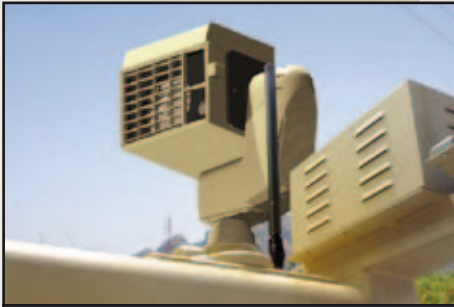
Large payload capacity