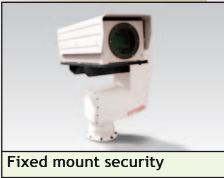
Fixed mount security