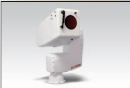
Stabilised thermal imaging