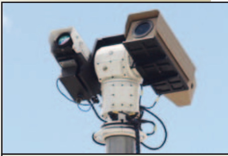
Large & heavy payloads