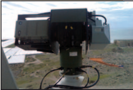
Long range surveillance