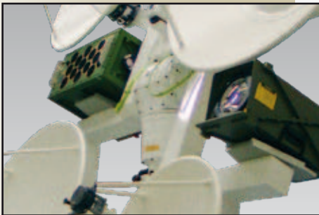
Accurate antenna positioning