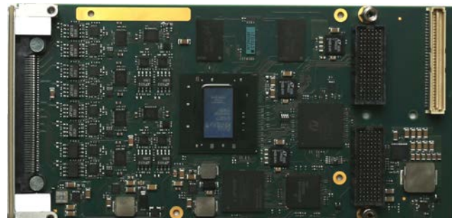
TXMC638-11R without heat sink